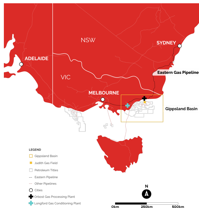
Figure 1: Gippsland Basin, Bass Strait